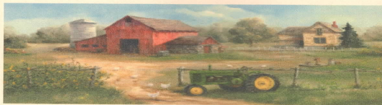
2005 Farm Family of the Year