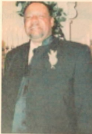
President of Craig & Lock